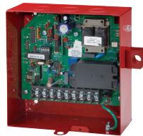
Isotrol Control Box

1 Note: An Isotrol with relay is utilized to activate the second pump when operating manifolded pumps. Reference the CoreDEF Installation Manual (577014-360).