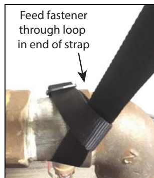
Figure 4. Attaching Strap To Piping