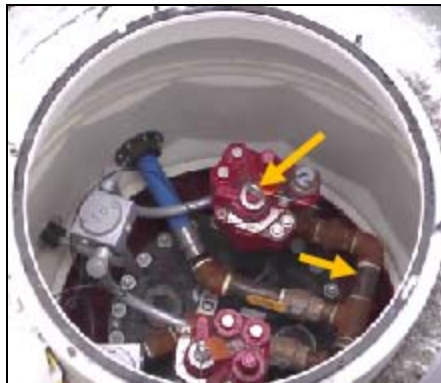
Figure 1. Sump-Dri Attachment Points