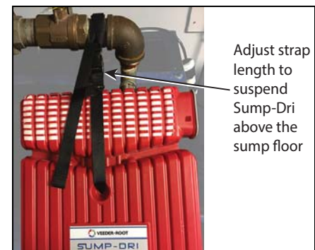
Figure 5. Secure Sump-Dri Off Sump Floor