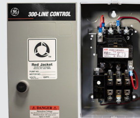
Magnetic Starter Box 0410648-001