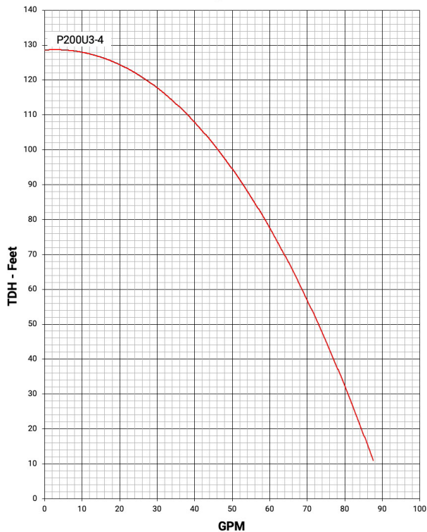
Performance @ 230V; SG = 0.78