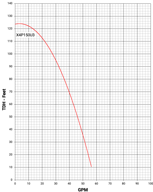
Performance @ 230V; SG = 0.78