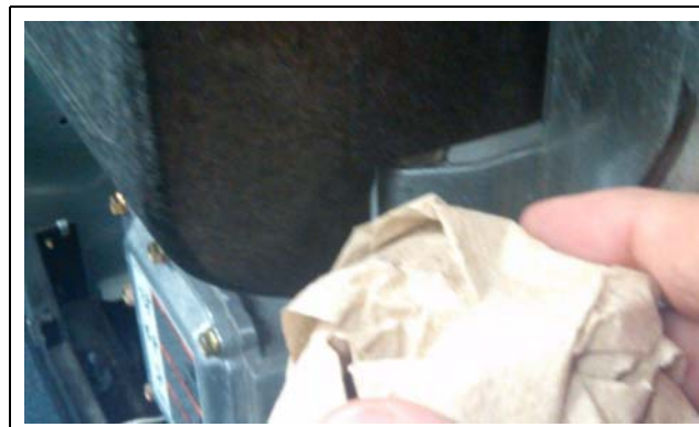
Figure 2: Cleaning the Bezel Area