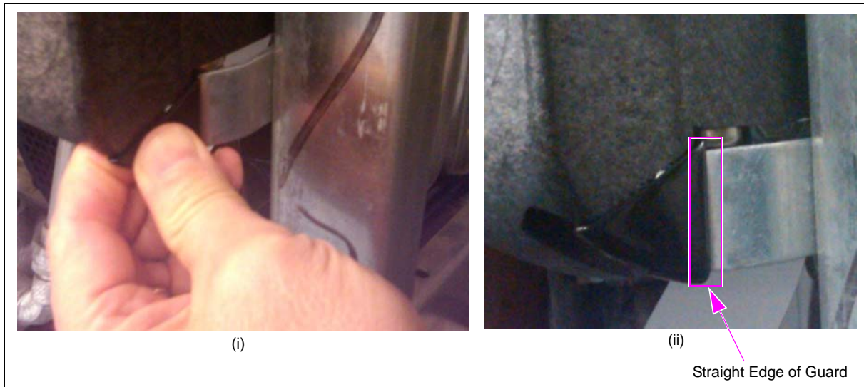
Figure 3: Holding the Guard