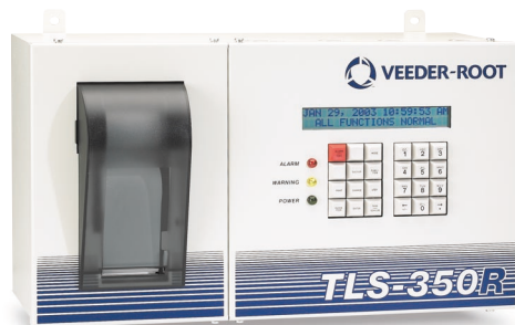
Veeder-Root TLS-350 and 300 Series Consoles