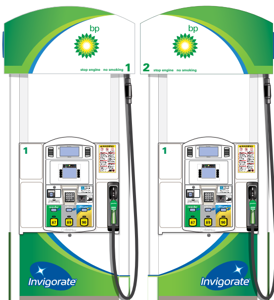
BP-BGB NL1 (A and B Side)