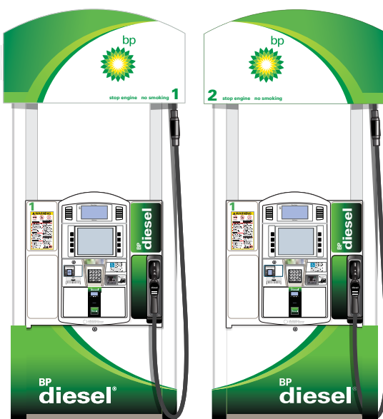
BP-BGB NAO (A and B Side)