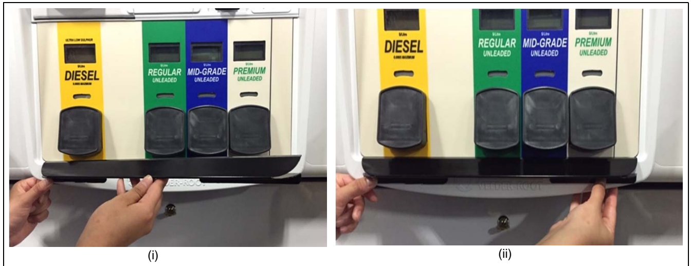
Figure 3: Placing PPU Guard Bracket in Position