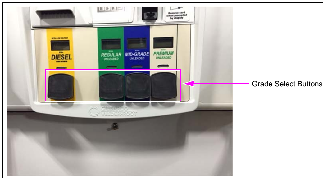
Figure 1: Encore PPU

To install the Encore PPU Guard Bracket Kit, proceed as follows: