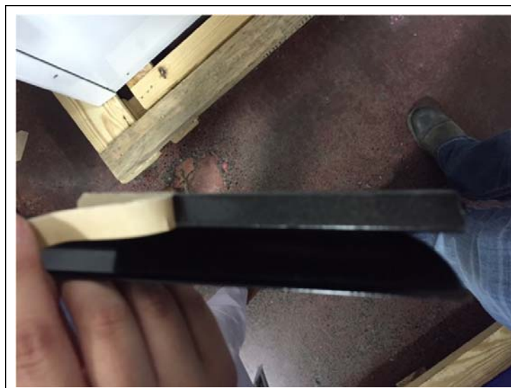
Figure 2: Peeling off Adhesive Backing