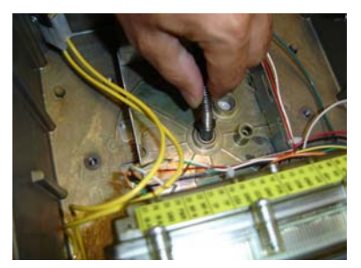
Figure 3. Inserting Input Shaft Into Base Of Display Head

4. Place the thin washer from the kit onto the input shaft against the underside of the flange on the input shaft and then CAREFULLY bend the spring to insert the end of the input shaft into the center hole on the bottom of the EMR³ display head (Figure 3. Install the meter coupling as instructed in the EMR³ Installation Guide, Manual No. 577013-758.