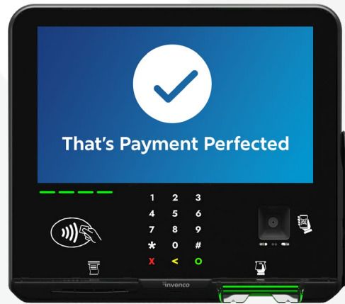
FlexPay 6 All-in-One 9 in.