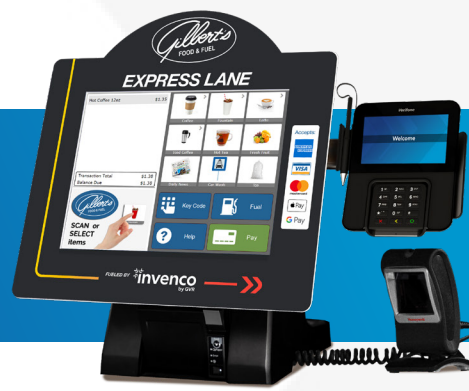
Express Lane™ Self-Checkout