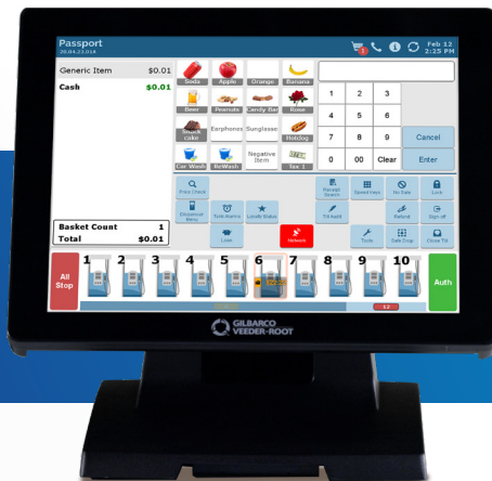
Passport® Point of Sale