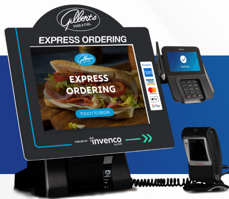
Express Ordering™ Foodservice Solution