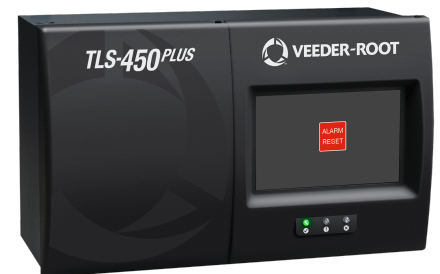
No Printer & No Display