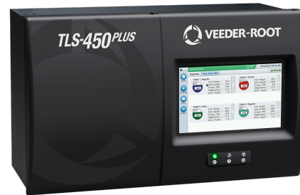
No Printer Version

Due to lower demand from these console versions, the cost to support these products is no longer feasible. Therefore, we are obsoleting specific versions of the TLS-450PLUS effective immediately .