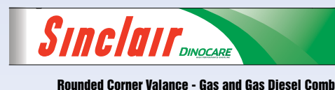
Rounded Corner Valance - Gas and Gas Diesel Combo